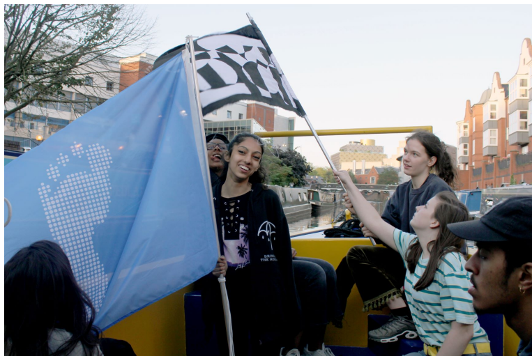
IYP take part in Ai Weiwei's Fly the Flag , marking the 70th anniversary of the Universal Declaration of Human Rights, June 2019